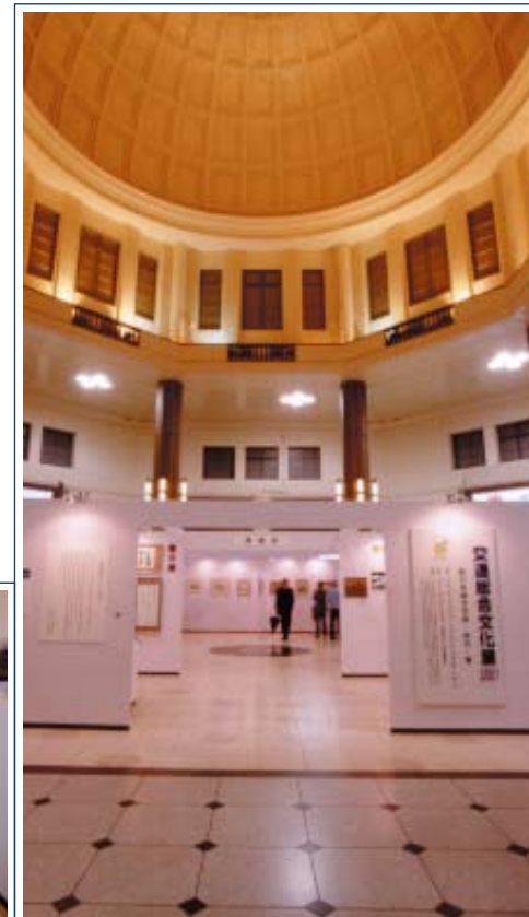
At the Exhibition (inside Tokyo Station)