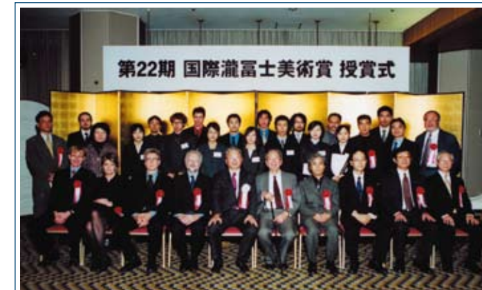
After the International Takifuji Art Award ceremony

Selected students from participating art schools both in Japan and abroad are awarded scholarships in the amount of 300 thousand yen for one year. Currently ten schools in Japan and a total of five schools in Asia, North America and Europe are participating in the program. We hope to further internationalize the program to include more schools from abroad.