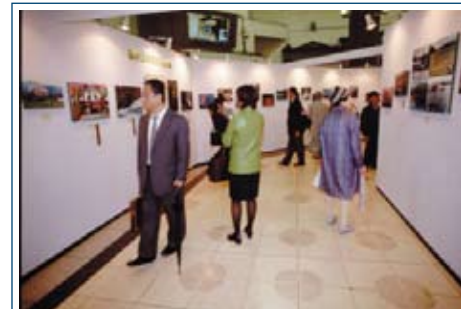
People enthralled by a piece of work

Concurrent with the culture exhibition, another exhibition called Sakuryokai is held, where paintings and calligraphy of prominent contemporary artists are exhibited to the public. This exhibition has gained much attention all over Japan for its rareness in exhibiting works of such a variety of artists of different schools.