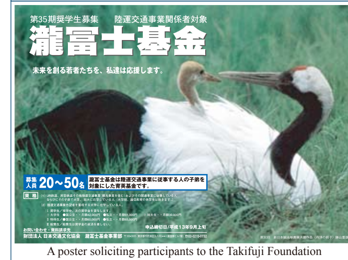
A poster soliciting participants to the Takifuji Foundation