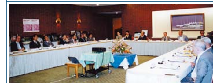
The First Special Committee Meeting