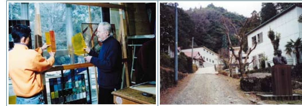
A scene at the Creare Atami Yugawara Atelier.

* The Institute's trademark "Creare" is the Latin word for "creation."